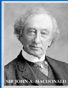
SIR JOHN A. MACDONALD