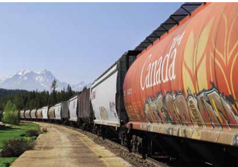
"The railway doesn't cross Manitoba or BC or Quebec. It crosses Canada. Ditto with pipelines, air travel, and a host of other things."

Railways pass through hundreds of communities in Canada where they never stop, and yet those communities run the risk of noise pollution, collisions, and catastrophic spills of chemicals and other toxic substances. People who live next to airports are surely inconvenienced by the noise and traffic.