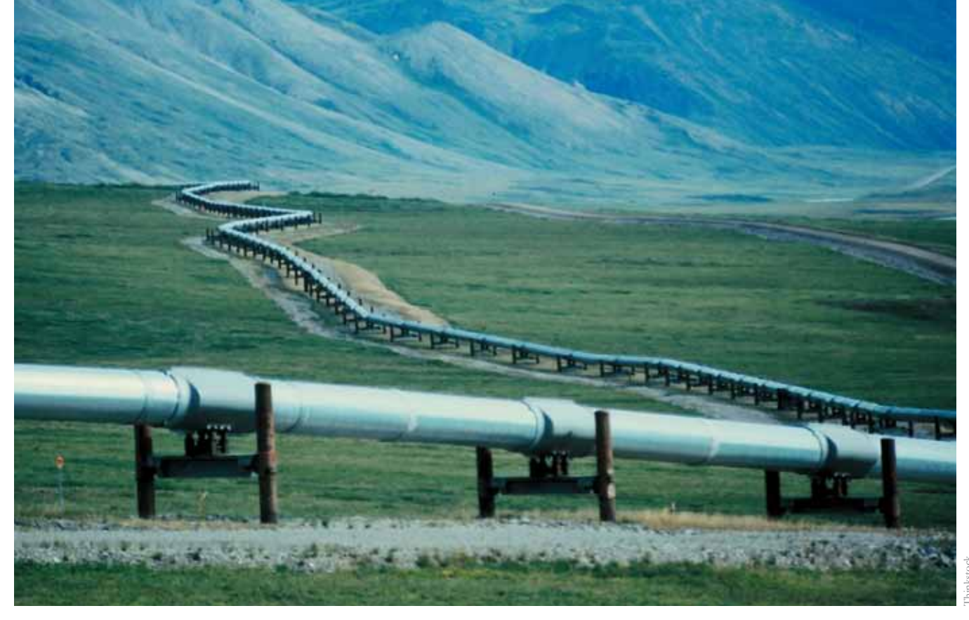
"Holding up projects that benefit the whole country simply because you think you haven't got your 'fair share', whatever that is, is the precise logic of protectionists and NIMBYists everywhere"

That's what countries too often do to each other and the result is the collective impoverishment of the world and we are busily engaged in a massive effort to try and tear down those barriers so that other countries cannot object to the importation of our goods and services on the grounds that such transactions benefit Canadians more than the citizens of those other places. We rightly regard it as a great victory for Canada that we have just negotiated a free trade agreement with the EU, for example, that will prevent local European industries and politicians from obstructing access to their markets for Canadian products, claiming that Canadians have not been granted "social licence" to threaten local livelihoods.