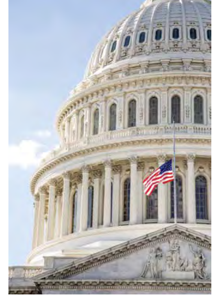
The U.S. Capitol building, Wahington, D.C.

But one of the most dangerous and egregious examples is what happened in Syria.