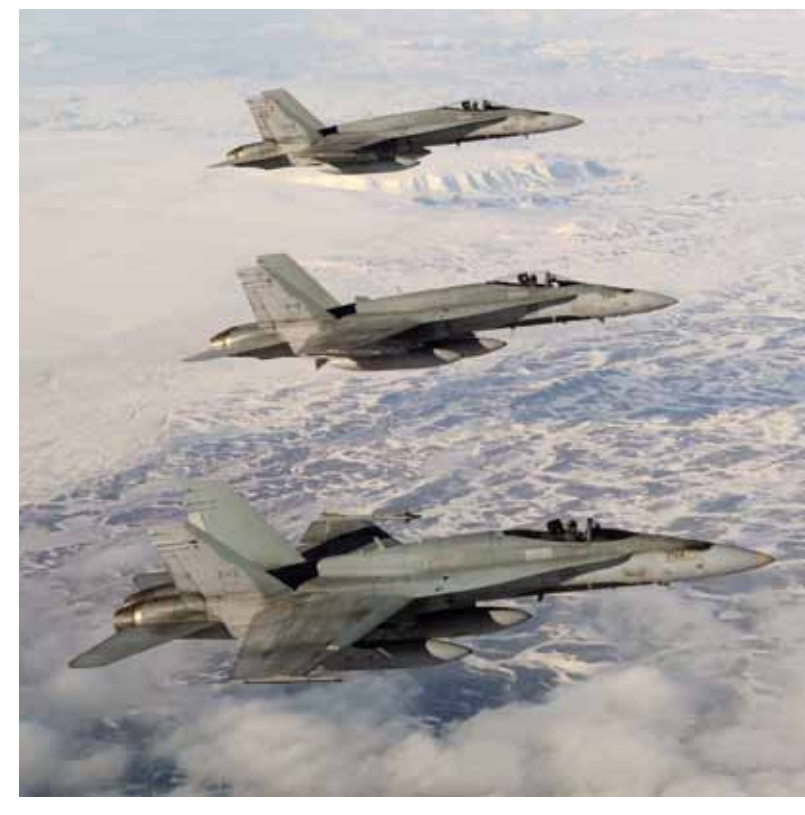
CF-18 jets fly over Iceland on March 25, 2013 during Operation IGNITION.

I suspect that as the middle powers like Canada see the US confirm its extreme reluctance to do more than talk about international security, they will do more out of self-interest in any case, as