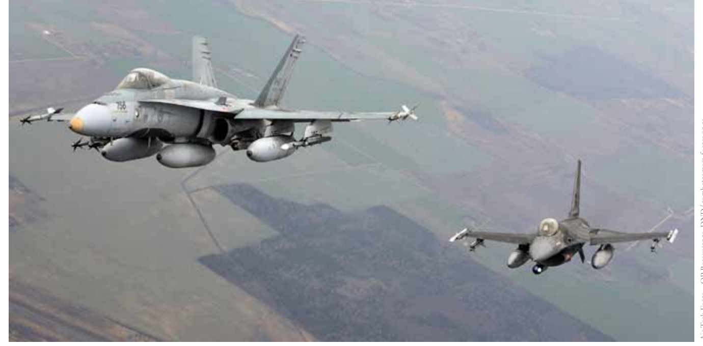
A CF-188 Hornet from the Canadian Air Task Force Lithuania flies side by side with a Portuguese F16 Fighting Falcon over Lithuania on November 20, 2014 for the NATO Baltic Air Policing Block 36 during Operation REASSURANCE.