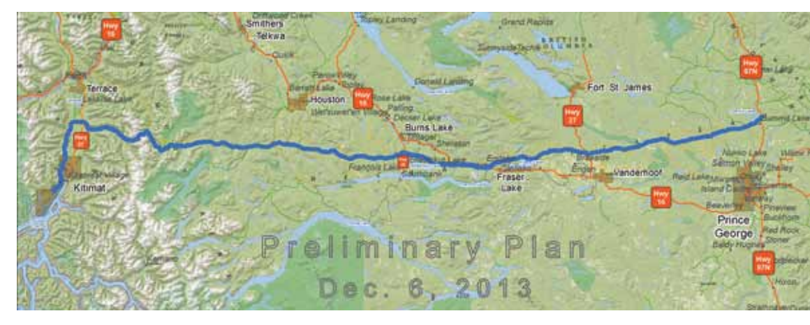
The Pacific Trail Pipeline in British Columbia is a proposed 480 km natural gas pipeline that will deliver gas from Summit Lake to the Kitimat LNG facility site at Bish Cove on the northwest coast of BC.

ing) information for a company, and the company needs to reflect on what it can do to avoid such situations. However, if someone transforms the descriptive statement that the company cannot operate with this low-level social licence into a prescriptive claim that the company cannot legitimately operate, that morphing of the statement logically depends on a presumption as to the legitimacy of the underlying violence. Unfortunately, over-enthusiastic embraces of social licence that actually misinterpret it through a sort of mistake about categories thereby undermine legally determined rights and even legitimize physical violence. Those who have rushed to embrace some interpretations of social licence because they are socially minded and support better flourishing of people in society should really think about whether they want to embrace a form of the concept through which they may legitimize physical violence.