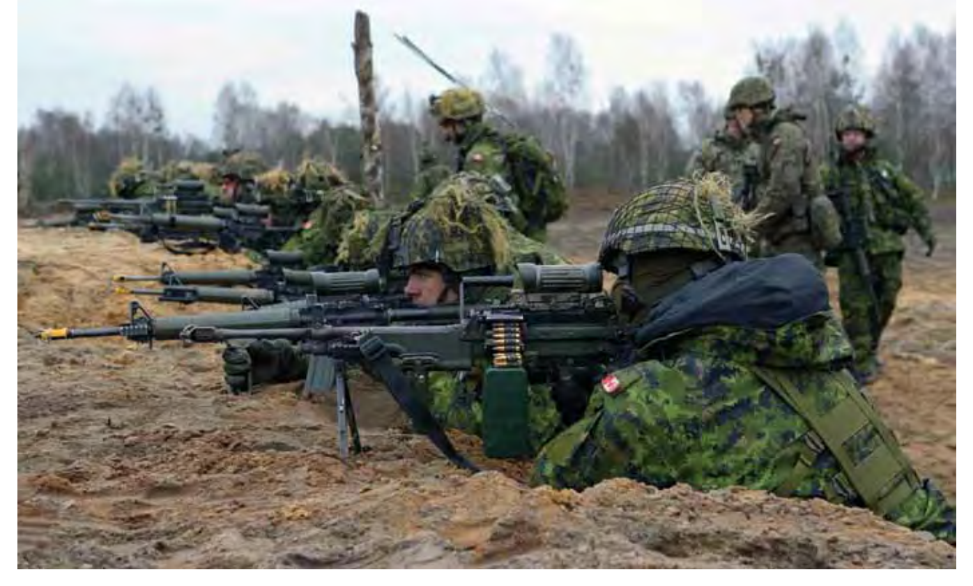
Members of Oscar Company Group, 3rd Battalion, The Royal Canadian Regiment conduct training with the Polish Army during Exercise Falcon in Central and Eastern Europe on November 23, 2014.

US President Barack Obama so reviles. But note too that it was a solution that depended unequivocally on a demonstrated willingness to use the military solution when all else fails. Red lines, and the willingness to enforce them, were key. I'll come back to red lines in a moment.