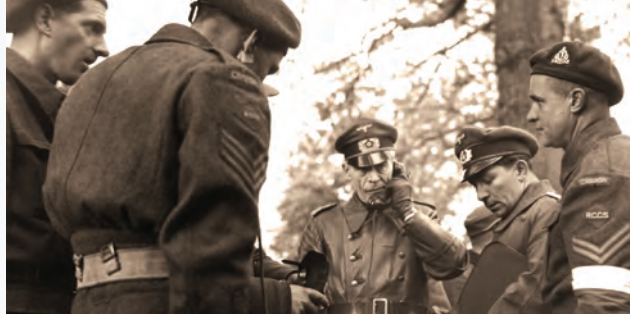
A German officer is linked up with Canadian and German forces at Wageningen in the Netherlands.

sent his infantry from the Algonquin Regt. across in boats. Against very heavy resistance, the bridgehead held, and soon the Royal Canadian Engineers had rafts operating and a bridge across the canal. The losses were heavy and continued to be so, but the 4th Armoured pressed forward.