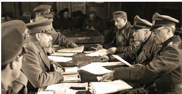
Lt.-Gen. Charles Foulkes (left centre) accepts the surrender of German forces in the Netherlands, May 5, 1945.