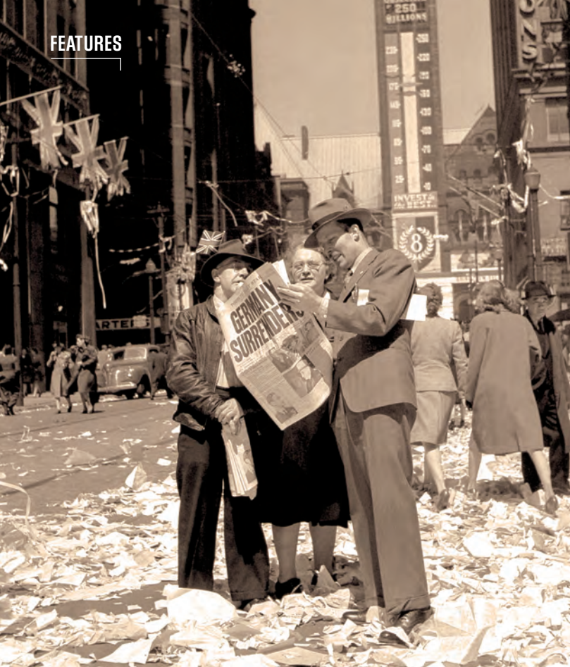
Clockwise from left: Torontonians read the news during downtown VE-Day celebrations, May 1945; members of the Seaforth Highlanders of Canada enjoy a smoke on May 5, 1945, in front of a sign that draws attention to the war in the Pacific; a smashed portrait of Hitler leans against a destroyed German vehicle, May 1945.