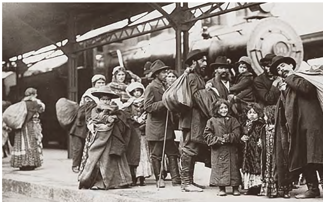
Arrival of immigrants at Union Station, Toronto 1911.

“Words jump off the page with Canada’s nascent national character, an image of ourselves in youth.”