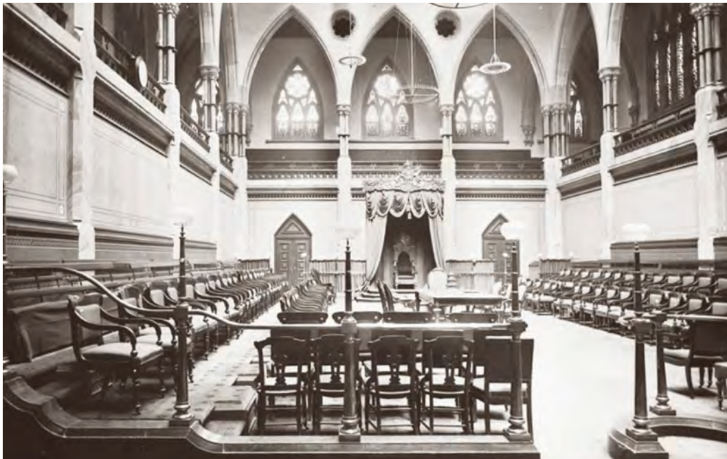
Senate Chamber, Library and Archives Canada.

began to face. George-Étienne Cartier voiced only the best-known of these Canadian formulas: “a political nationality with which neither the national origin, nor the religion of any individual would interfere” (Canada 1865, 60). Other founders added their own gloss on this very Canadian alchemy suggesting diversity is the thread linking their Canada and our Canada, how to manage it the constant task of Canadian statecraft. Thomas D’Arcy McGee told Canadians, “There seems to be a good deal of exaggeration on the subject of race. Whose words are these – ‘God hath made of one blood all the nations that dwell on the face of the Earth?’” (Canada 1865, 143). Alexander Galt called on Canadians to “find in the diversities of race and religion an incentive to honourable rivalry in favour of our common country, rather than to leave them, as now, the subjects by which any party leader may build up an evanescent and baneful popularity by arraying one class against another.” 2